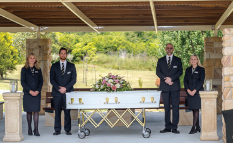
The Garden Chapel

meets your wishes, particularly if they are unsure what those wishes are. All in all, your Creightons Pre-Paid Funeral Plan will bring great comfort to your loved ones at a time when they need it most.