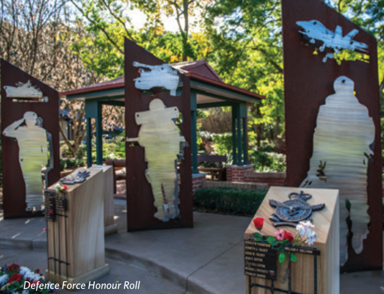
Defence Force Honour Roll